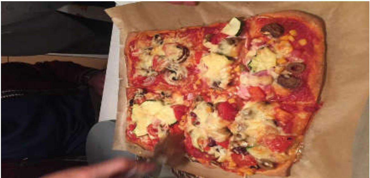
Pizza night at my place 😊