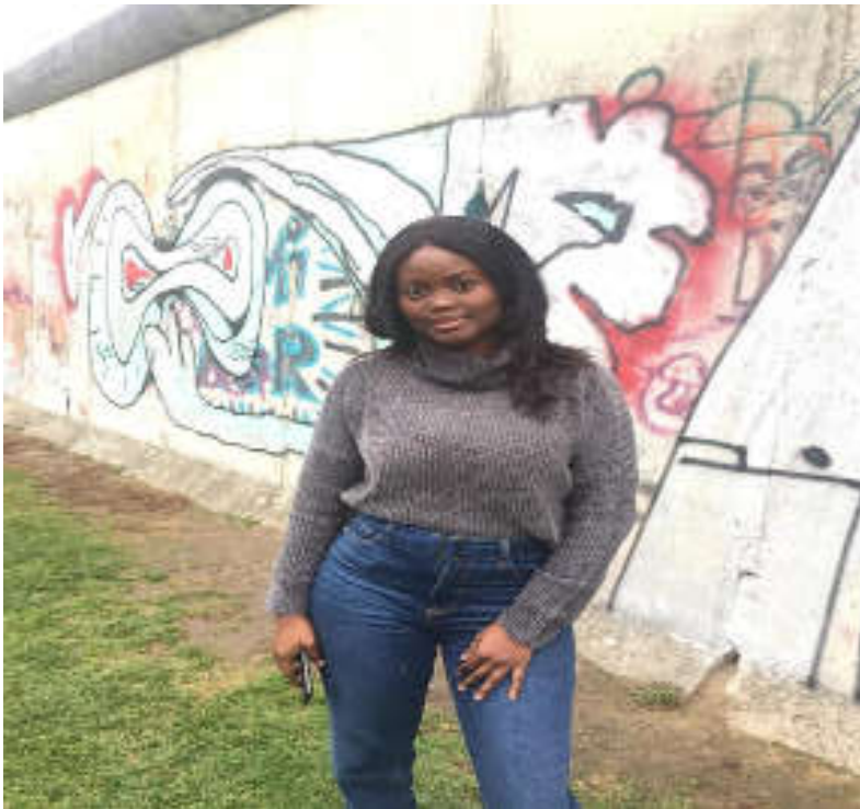
The Berlin wall.