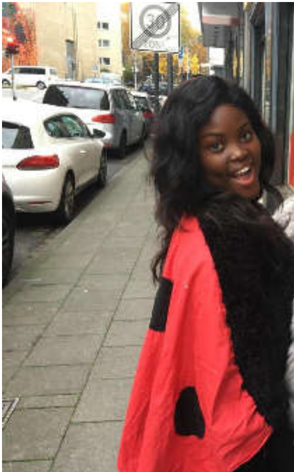
Me in my costume 😊