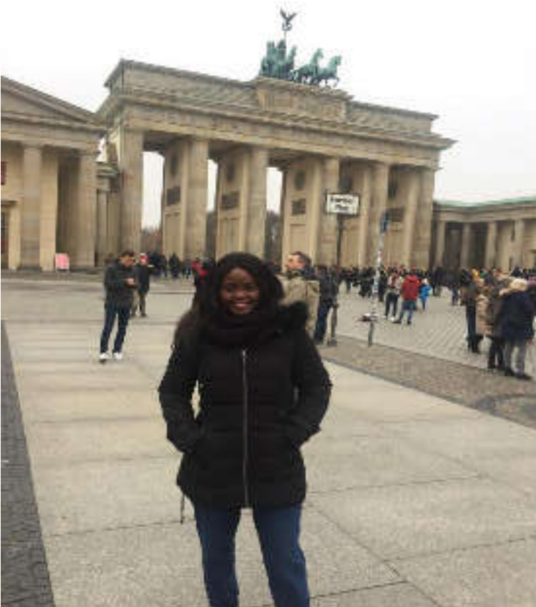
The Brandenburg Gate.