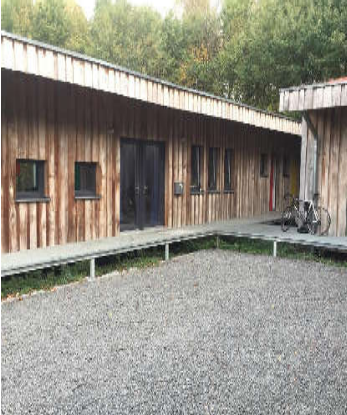
Our house in the woods ☺