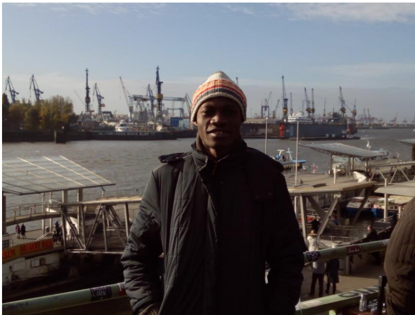
Near to the harbor of Hamburg

Less and less partys for me. Usually, I play football in Weekends. I also had a long weekend in Hamburg where I've been visiting quite a lot of places like Reeperbahn, the beautiful Alster Lac, the renown St. Michael's Church, etc... and of course the great harbor of Hamburg. Eating some fresh fish at the sea was a pleasure!