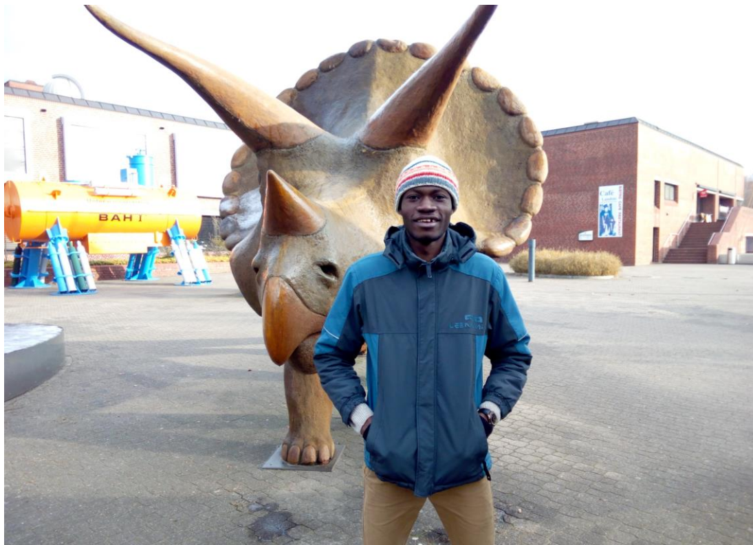
Westfälisches Museum für Naturkunde, Münster